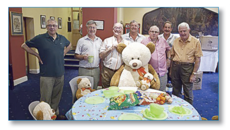
Members of the Metropolitan Board of General Purposes with Big Ted and some of his cousins, together with members of the TLC Committee, on the day before Summer Lodge.

9.00 a.m. on Tuesday, 16<sup>th</sup> July, 2013 all seems calm in Molesworth Street. Little do the hundreds of people passing Freemasons' Hall know that nerves are stretched to almost breaking point for a small number of 'those guys' in there. It is the day before Summer Lodge, Masons from